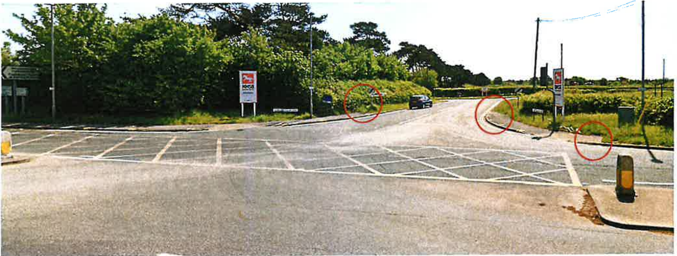
JGL/4 – Photograph of footpaths opposite Airport entrance.