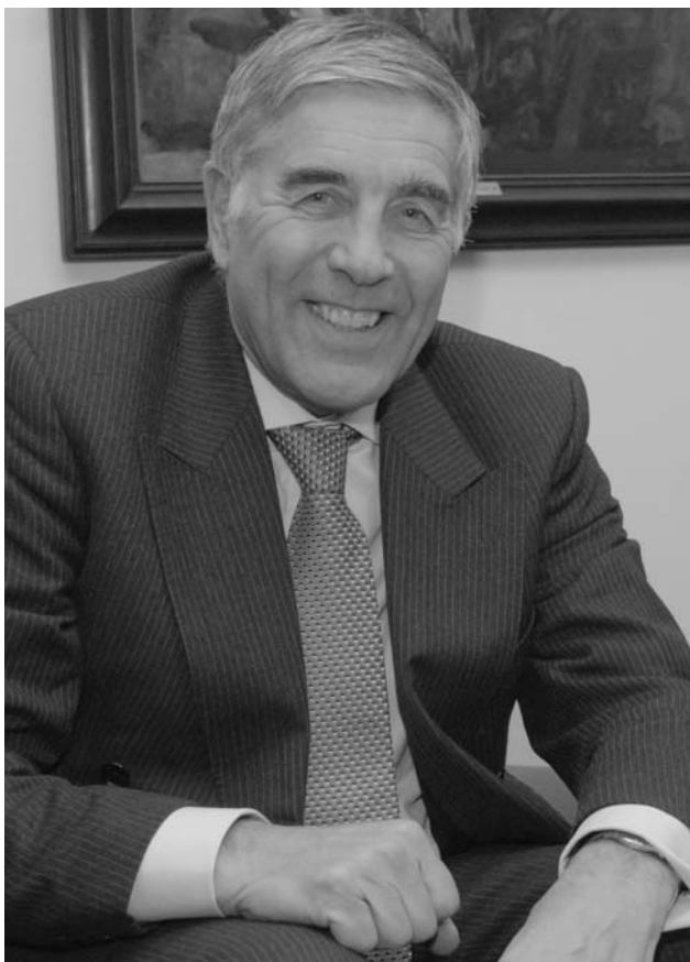
Chairman of the Judges' Council, The Rt. Hon Lord Phillips of Worth Matravers

I am delighted to introduce the Third Annual Report of the Judges' Council of England and Wales. Several very important issues arose during 2007, involving the setting up of the new Ministry of Justice (MoJ), consultation on the relationship between the Executive, Parliament and the Judiciary, the provision of resources for Her Majesty's Court Service (HMCS) and the relationship between the Judiciary and HMCS. Members of the Council have been working tirelessly on my behalf to provide appropriate responses and arrangements that are consistent with my role as Head of the Judiciary. The