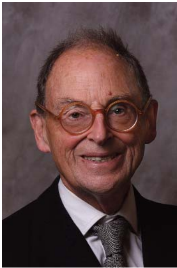
The Rt. Hon. Lord Justice Thorpe Head of International Family Justice for England and Wales Lord Justice of Appeal Liaison Judge for England and Wales Royal Courts of Justice

Hague Convention cases. Where judgment should be issued within 6 weeks 3 it takes on average 165 days between Brussels II bis States and 215 days where neither State was a Brussels II bis State. Only 28% of Brussels II bis applications to England and Wales were resolved in 6 weeks (37 out of 130) 4 .